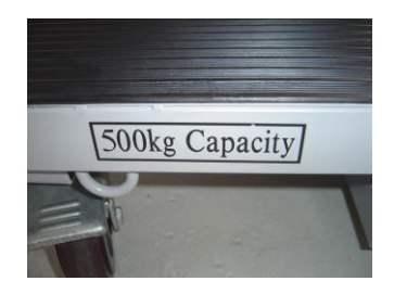
LOAD CAPACITY - 500kg Evenly distributed loads as recommended

DO NOT OVERLOAD or obstruct operator view with high loads.