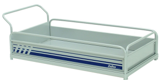
PLATFORM 885X1250XH230 MM