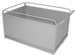
PLATFORM 800X1250XH630 MM