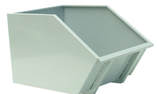
PAINTED SKIP 500 L