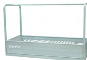
PLATFORM 1800X800 MM