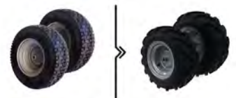
TRACTOR WHEELS (2 WHEELS)