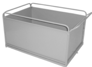
PLATFORM 800X1250XH630 MM