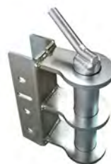
DROP PIN Ø38 MM