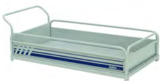
PLATFORM 885X1250XH230 MM