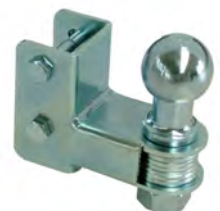
TOW BALL PIN COUPLING