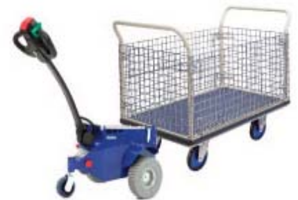
M3 + PRESTAR NG407

It is equipped with non-marking tyres and gel batteries to reduce maintenance. All Zallys tugs are produced with quality in mind and are CE certified.