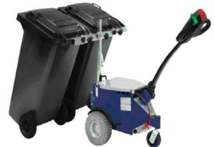
M3 + Sulo Bin Attachment