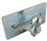
TOW BALL COUPLING