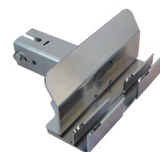
ROLL BOX HITCH