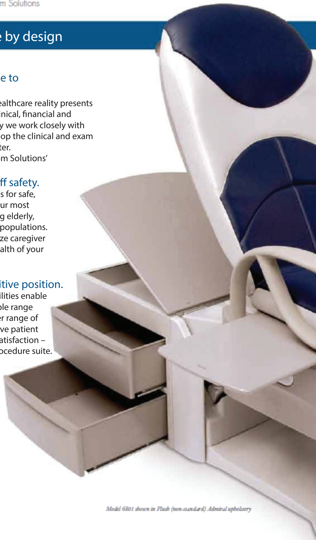
Model 6801 shown in Plusb (non-standard) Admiral upholstery

Innovative designs and capabilities enable you to see the broadest possible range of patients and provide a wider range of services. They also help preserve patient dignity and enhance patient satisfaction – from the exam room to the procedure suite.